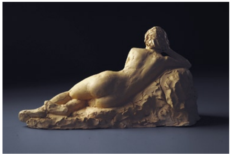
ALAN LEQUIRE, JANELLE, TERRA-COTTA, 9 X 16 X 6"

sensuality of the practice. To really see someone to allow my eyes to rest on every shift in turning form feels life affirming."