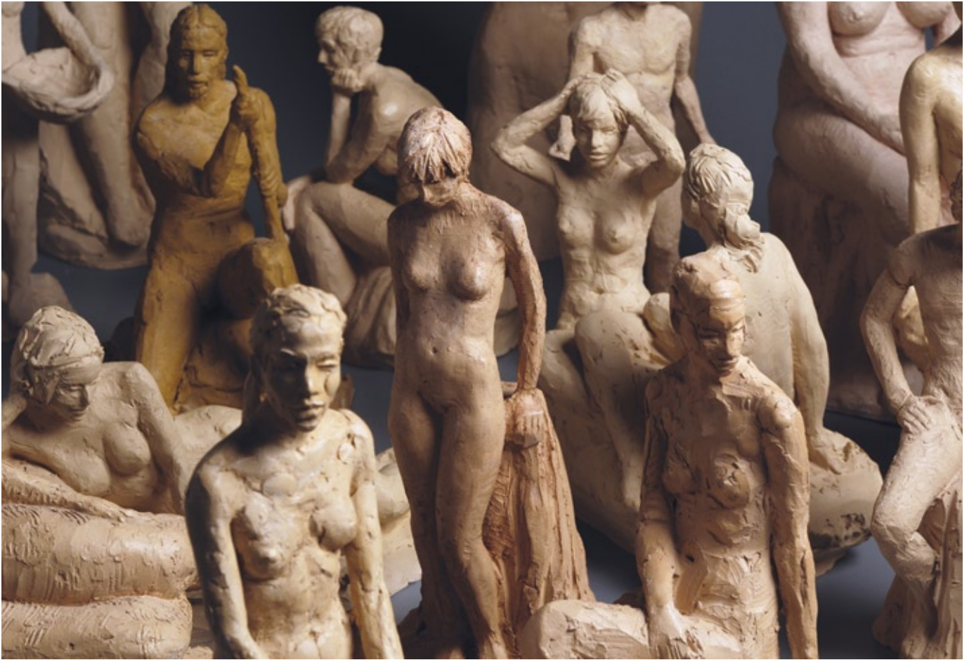
ALAN LEQUIRE, TERRA COTTA FIGURES